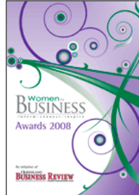
Women in Business